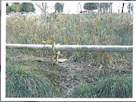
Leachate seeping from side of the landfill