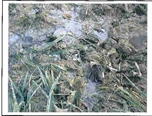
Seepage is full of toxic compounds

The residents of our neighborhood would like to know the facts and we are hoping that you and your staff can help us with that. We know that some day the County will use the land at the landfill but they seem so focused on their growth initiative that they are forgetting about the health and safety of our neighborhood. We feel we are being steamrolled.