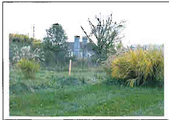
Backyards are 350ft from flares