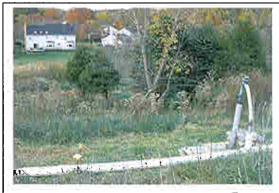
Houses are about 200ft from LFG wells

This summer as part of a growth initiative, the County proposed to relocate a bus maintenance depot and 350 buses to the Gude Landfill. If they do this, we are very concerned about migration of the landfill gas and the runoff of the leachate. Our questions to the County are going unanswered and we are being told that Gude is an unregulated landfill and the County does not need permission to build there. The County explained to us that they will mitigate the risk. That scares us.